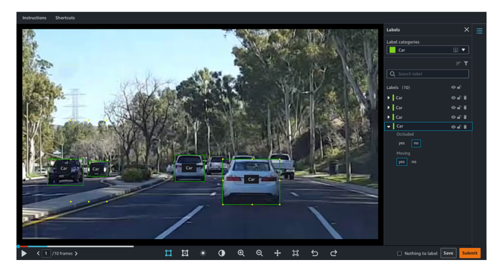
Figure 1: Task interface.

value were asked to label and track vehicles with five possible labels of higher specificity (i.e., "Car", "Van", "Bus", "Truck", and "Motorbike"), which reflect the most common vehicular labels in publicly available datasets (Agarwal and Suryavanshi 2017). This means that annotators who only differed on level of label granularity were expected to generate all of the same annotations, with the only difference being the level of label specificity assigned to each annotation. Tasks completed with a "low" value for label constraint were only asked to label all motorized vehicles (that belonged to a valid object class, if the corresponding label granularity was high), while tasks with the "high" value needed to consider all of the constraints found in Table 1 before deciding whether to create an annotation.